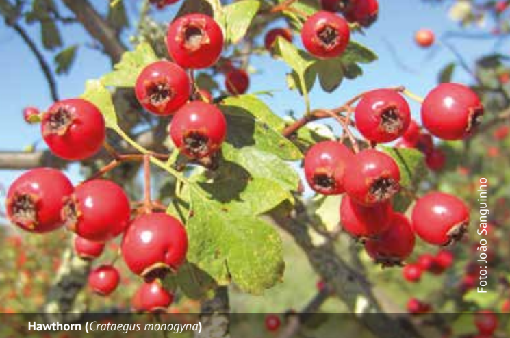
Hawthorn ( Crataegus monogyna )