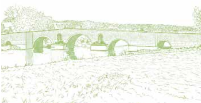
Roman bridge over the Ribeira Grande. Currently displays 6 arches, but it may have another 6 arches buried by silting.

This path is characterized by its almost flat profile and by the frequent crossing of watercourses, features that make it easy and fresh for walking.