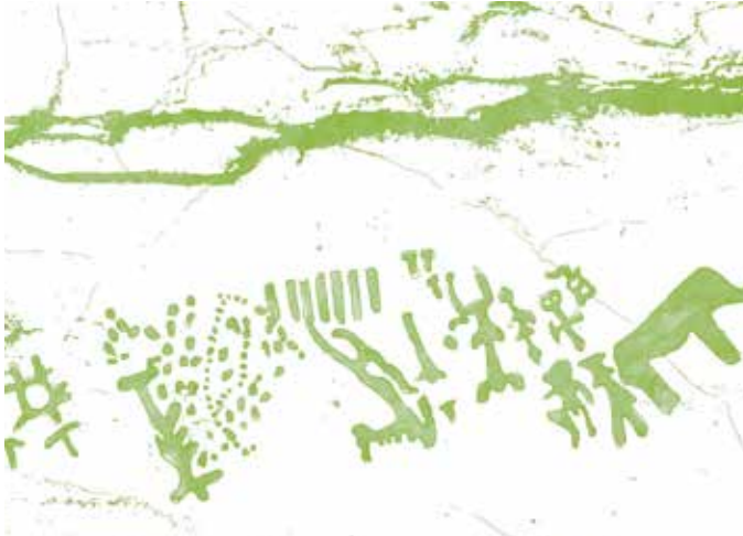
Rock paintings of Lapa dos Gaivões. Paintings on red, orange and black, about 5000 years old, decorate the natural shelter of Lapa dos Gaivões, classified as a National Monument.

The houses are white in Esperança - with only one floor and large chimneys - decorated with stripes, either blue, or ochre, such as in the Church of N. Sr.ª da Esperança, near where the path begins. Up to Hortas de Cima the path has an asphalt surface and, from there, we keep going along steeper roads. In fact, the whole path is set in a transition zone between the gently rolling plain and the rugged ups and downs that extend to the areas of rugged cliffs of the Serra de São Mamede. At Marco we realize that the international border follows the flow of water of the Abrilongo Stream. It takes only three steps and we are in Spain.