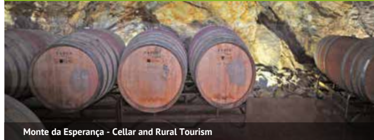
Monte da Esperança - Cellar and Rural Tourism