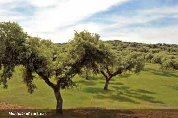
Montado of cork oak