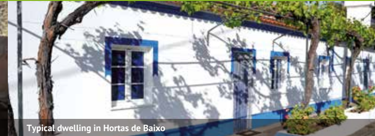
Typical dwelling in Hortas de Baixo